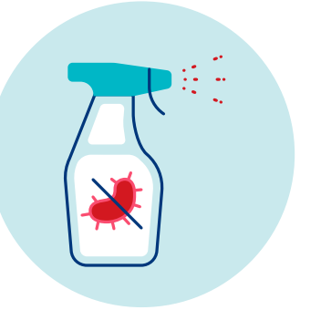
Clean surfaces frequently including door handles, rails, hoists etc.

Wash hands frequently (for at least 20 seconds) or use a hand sanitizer with a minimum of 60% alcohol