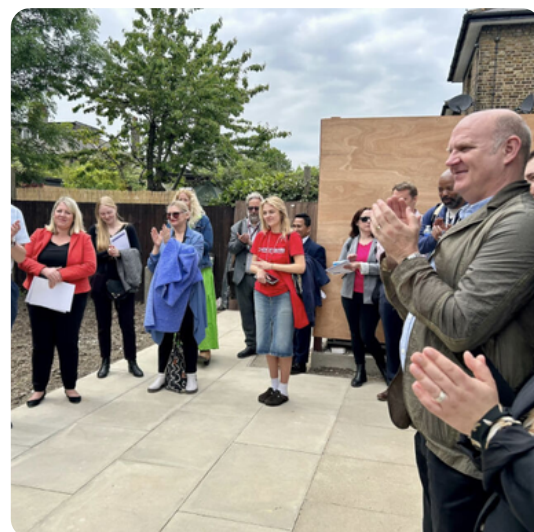
Launch event for the NCL Accommodation

The next site to launch will be in East London in the coming months.